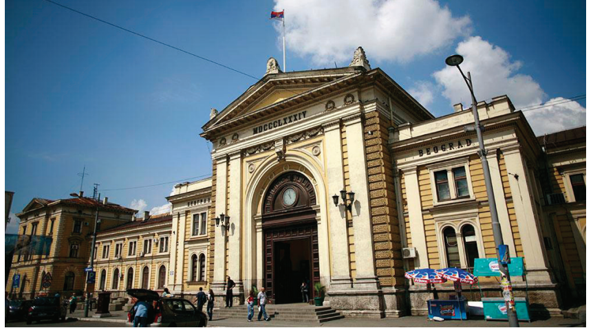
Train station, 1882

Moscow 2211 km Oslo 2577 km Prague 901 km Rome 1280 km Sarajevo 325 km Skopje 440 km Sofia 380 km Thessaloniki 700 km Stockholm 2622 km Warsaw 1115 km Zagreb 390 km