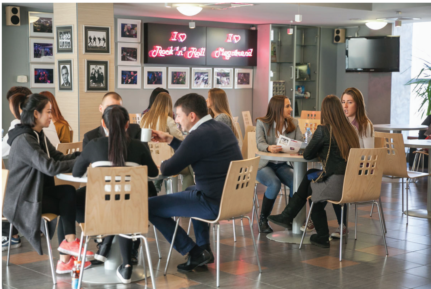
Caffe "Club", Megatrend University

http://esn.rs email: office.belupgrade@esn.rs