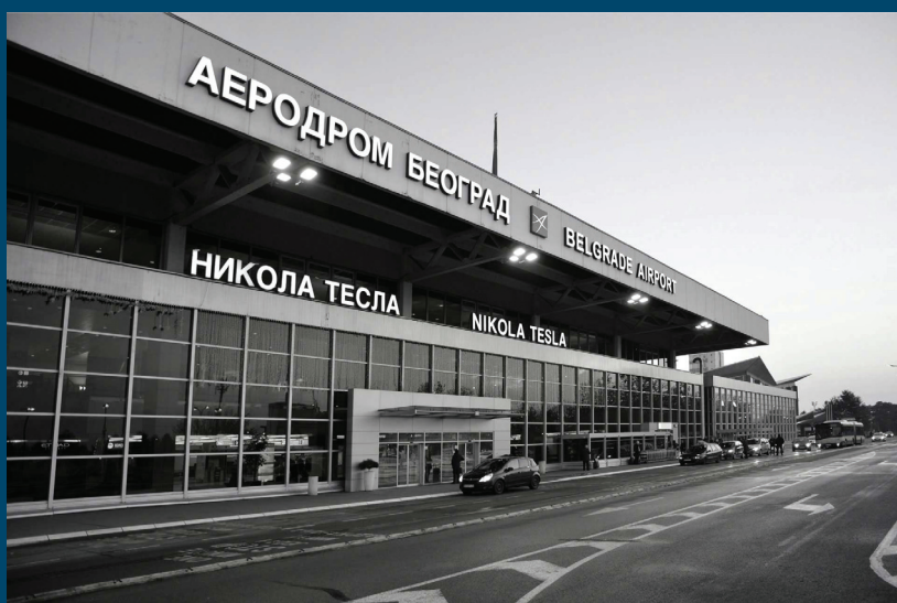
Airport “Nikola Tesla”